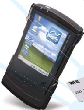
WF35 with MSR