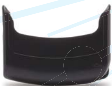
Magstripe Card Reader (MSR)

To deploy multiple PDAs to a consumer site is never an easy task, so the WF35 provides two modes of operation: Administration and User Modes. System settings and parameters are stored under the Administration Mode and users cannot modify settings without proper authority. In User Mode, only designated applications can be viewed and executed. Functions such as file copy, music, video and games are all removed. The in-built "Ghost 1 " feature (system backup) enables easy mass deployment of the WF35, while all system settings can be unified and stored for each customer site. With the availability of spare parts, services providers can also perform hardware maintenance locally.