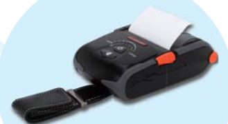
BIXOLON SPP-R200 Bluetooth Mobile Printer

Industrial specific features, e.g. drop tested, MSR, Bluetooth, vibrator, signal lighting, strap.